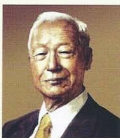
H.E. Syngman Rhee