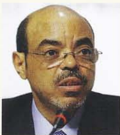
H.E. Meles Zenawi