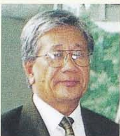
H. E. Kuniwo Nakamura