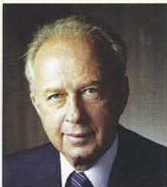
H.E. Yitzhak Rabin

Pre-eminent political and ideological leader of India