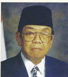
H.E. Abdurrahman Wahid