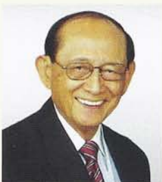
H.E. Fidel Valdez Ramos