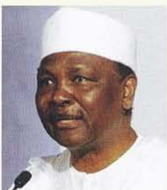
Gen. Yakubu Gowon