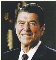
President Ronald Reagan, U.S.A.