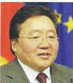
H.E. Punsalmaagiin Ochirbat