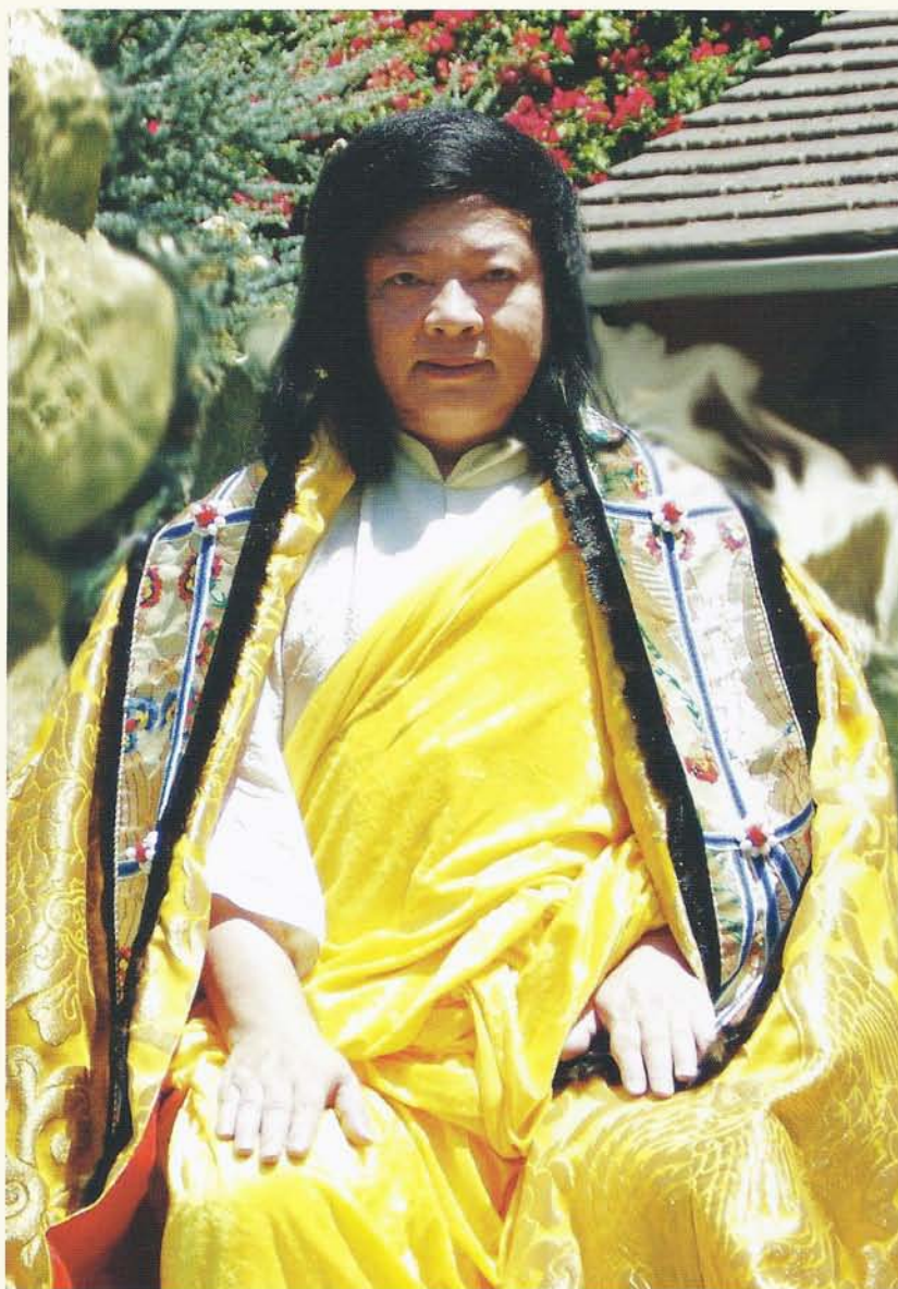
H.H. Dorje Chang Buddha III