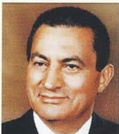
H.E. Hosni Mubarak