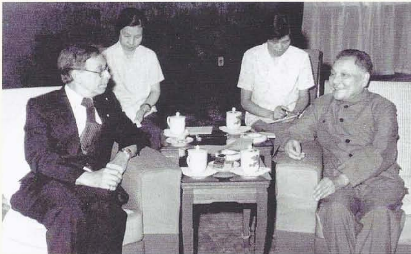
Hon. Lester Wolff and Deng Xiaoping in China, 1978

“He shall judge between the nations, and shall decide disputes for many peoples; and they shall beat their swords into plowshares, and their spears into pruning hooks; nation shall not lift up sword against nation, neither shall they learn war anymore” Isaiah 2:4 ESV